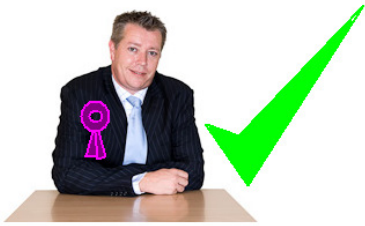
Minister of state